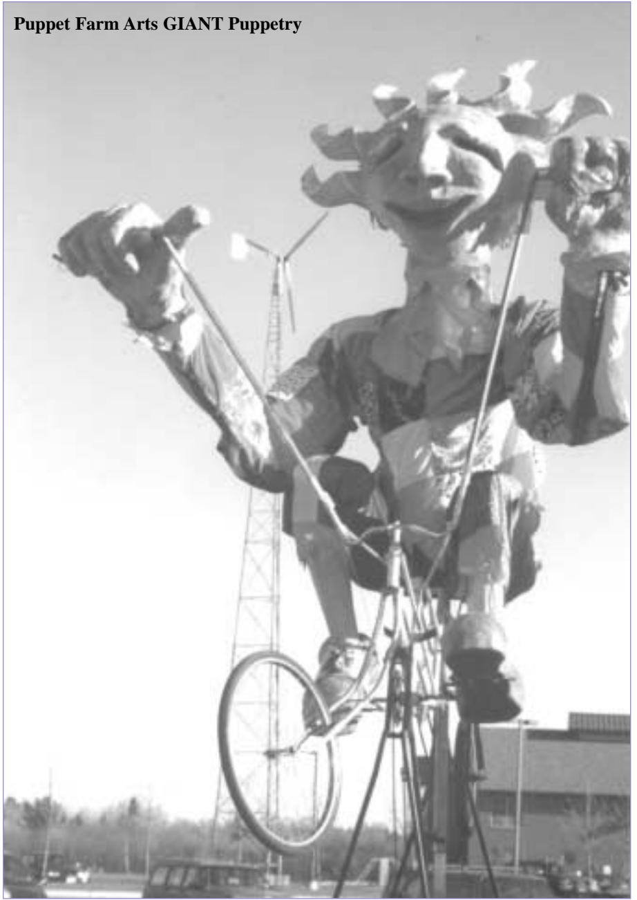
Puppet Farm Arts GIANT Puppetry